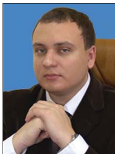
Alexander S. Ryzhkov Рижков Олександр Сергійович